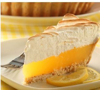
Lemon Meringue Pie Short crust pastry case filled with lemon custard and crowned with luscious meringue. (14 Portions)