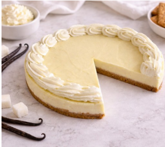
Vanilla Cheesecake A baked vanilla cheesecake on a solid biscuit base. (12 Portions)