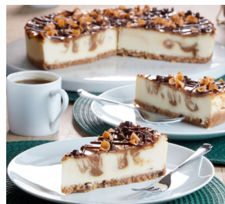
Salted Caramel Cheesecake A creamy vanilla cheesecake with salted caramel ripples, topped with salted caramel and chocolate sauce, and caramel and chocolate curls. (12 Portions)