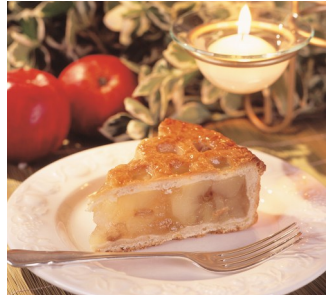
Belgian Apple Pie Lattice short crust pastry filled with apples, sultanas and a hint of cinnamon. (12 Portions)