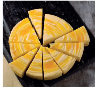
Sicilian Lemon Cheesecake A crisp lemon shortbread base topped with a Sicilian lemon cheesecake and swirled with sour cream cheesecake and lemon curd. (14 Portions)