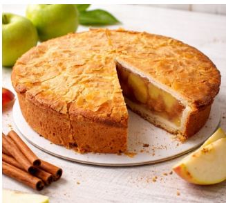
Deep Dish Apple Pie A traditional apple pie filled with a juicy apple and cinnamon filling encased in a buttery pastry case. (12 Portions)