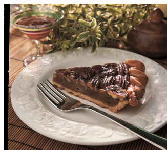
Pecan Pie Short crust pastry generously filled with pecan nuts and treacle. (12 Portions)