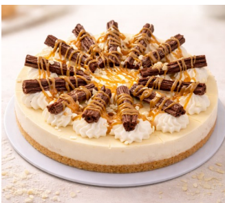
Toffee & Chocolate Cheesecake A creamy cheesecake, with chocolate logs resting on cream rosettes drizzled with toffee sauce and white chocolate. (14 Portions)