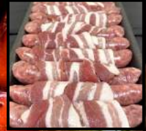
Fresh Pigs in Blankets