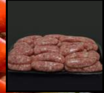
Pork Cocktail Sausages 32's