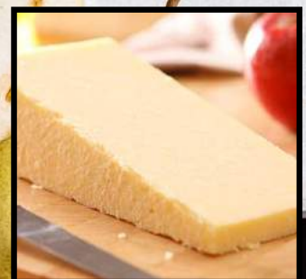
Dorset Coastal Cheddar