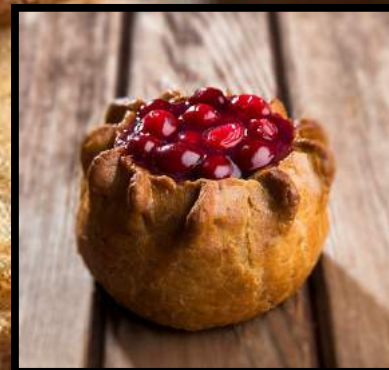
Turkey and Cranberry Pie