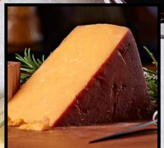
Dorset Smoked Red Cheddar