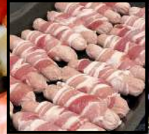
Frozen Pigs in Blankets