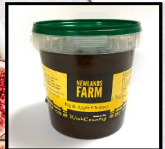
Fig and Apple Chutney