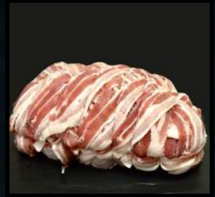
Stuffed Turkey Breast Wrapped In Bacon