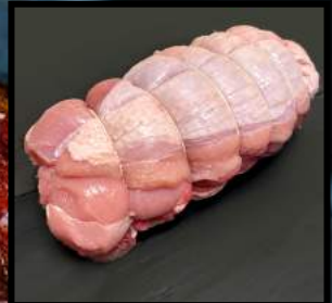
Mixed Turkey Joint