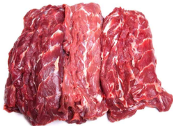
Frozen Boneless Venison Neck (5kg) Normally £10.75 / kg NOW £9.50 / kg