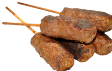
Frozen Kofta Kebabs (5 per pack) Normally £4.95 / pack NOW £4.25 / pack