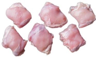
Polish Skinless Boneless Chicken Thighs (5kg) Normally £5.20 / kg NOW £4.95 / kg