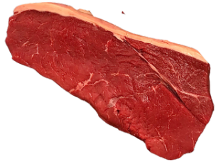
UK/Irish Rump Steak (16oz) Normally £5.60 / each NOW £5.25 / each

*OFFERS VALID FROM Wednesday 1st February to Tuesday 28th February