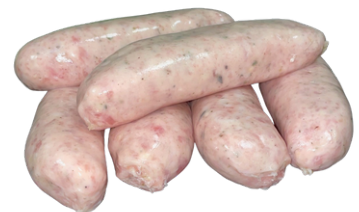
Lincolnshire Sausage 6's (1.2 or 2.5kg trays) Normally £5.45 / kg NOW £ 4.90 / kg

To place your order call us today on 01202 440900!