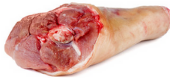
Gammon Hocks (Packed in 2) Normally £2.75 / each NOW £2.50 / each