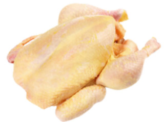
Frozen Whole Corn Fed Chickens (1.3 - 1.5kg) Normally £4.95 / kg NOW £3.64 / kg