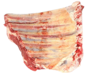
UK Beef Short Ribs (2kg+) Normally £8.25 / kg NOW £7.80 / kg