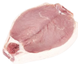
6oz Pork Valentine Steaks (5) Normally £6.80 / kg NOW £ 6.25 / kg