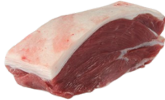
NZ 8oz Lamb Rump (Individual) Normally £5.75 / each NOW £5.50 / each